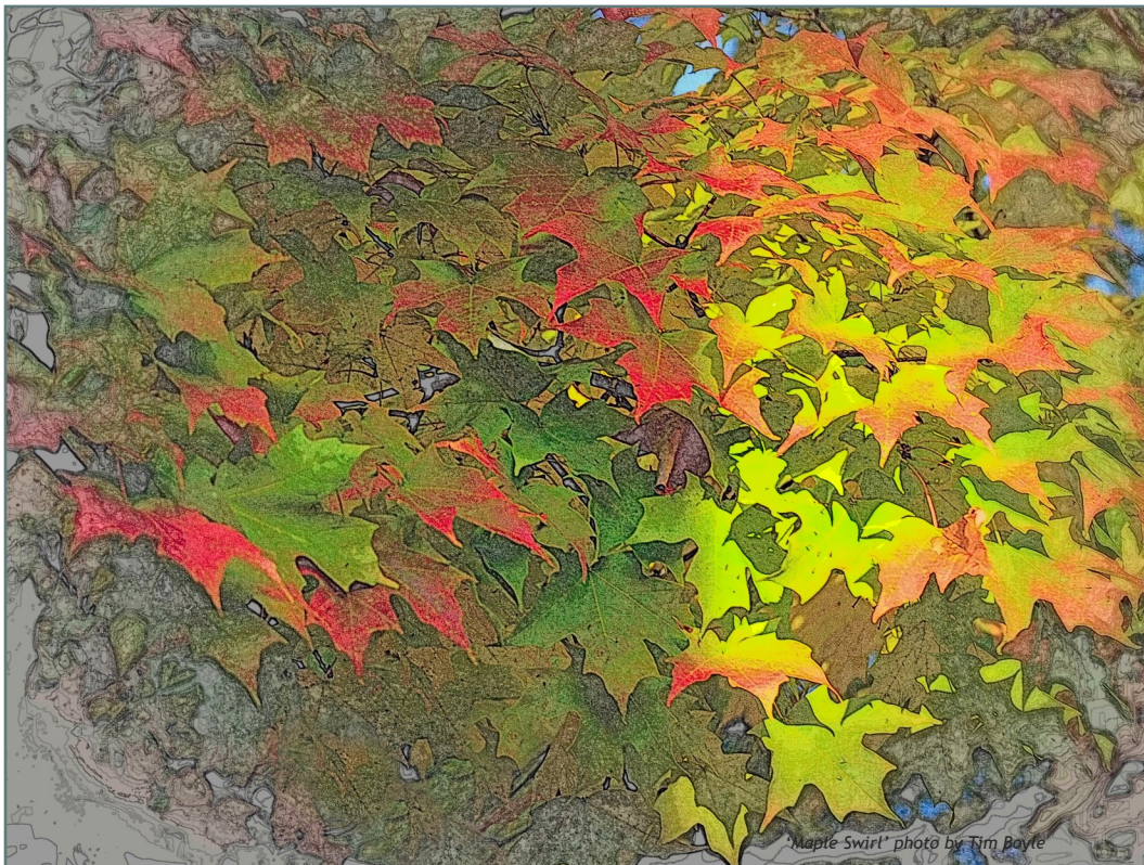
"Maple Swirl"

Plans are underway for a special event on Monday November 18th at 6:30 PM.