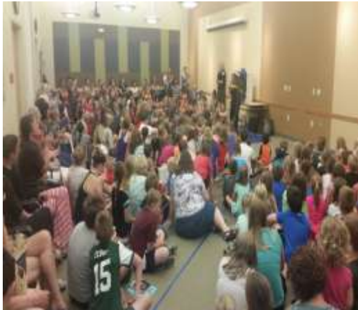
Left: Kids & adults enjoying the program